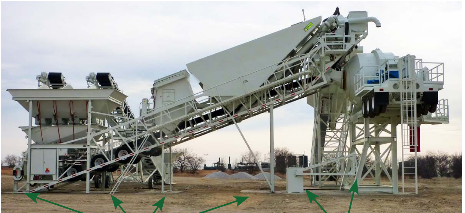
Mounted on Steel Plates